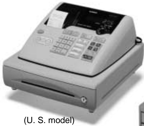
(U. S. model)